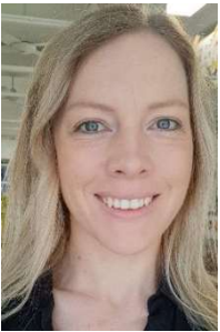
Rising Dancers Coordinator

“Dance is the hidden language of the soul” --- Martha Graham